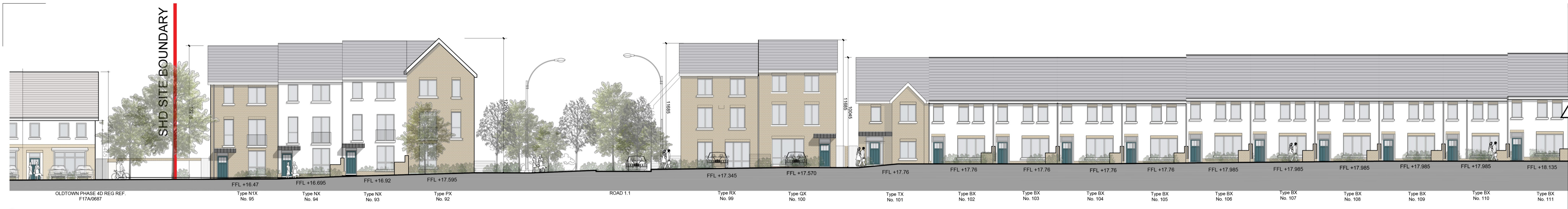
Contiguous Elevation A-A