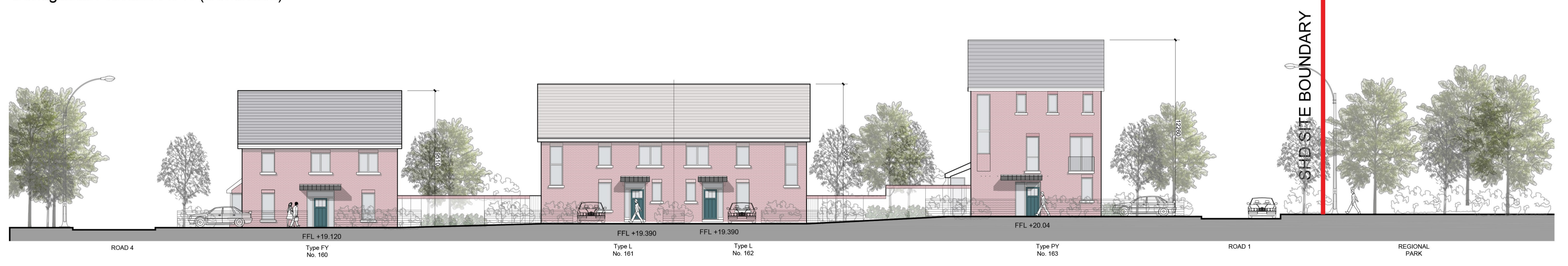
Contiguous Elevation B1-B1 (Continued)