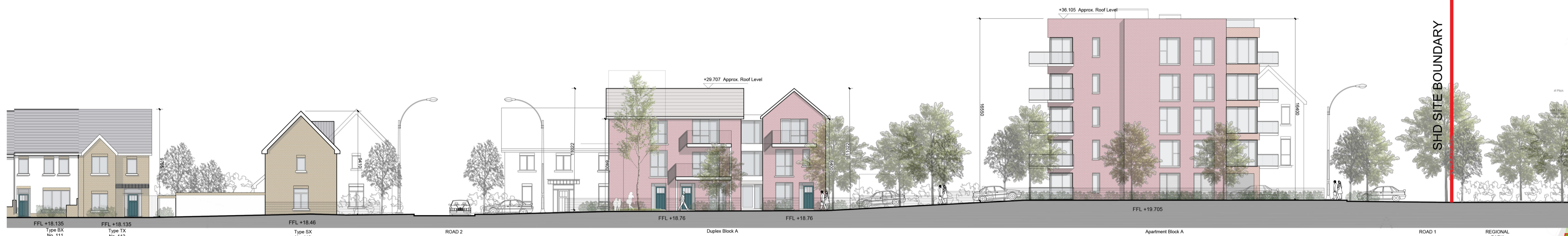
Contiguous Elevation A-A (Continued)