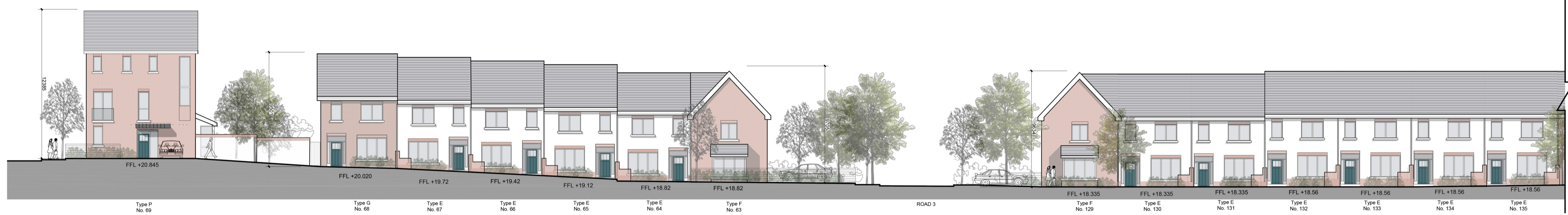
Contiguous Elevation B-B